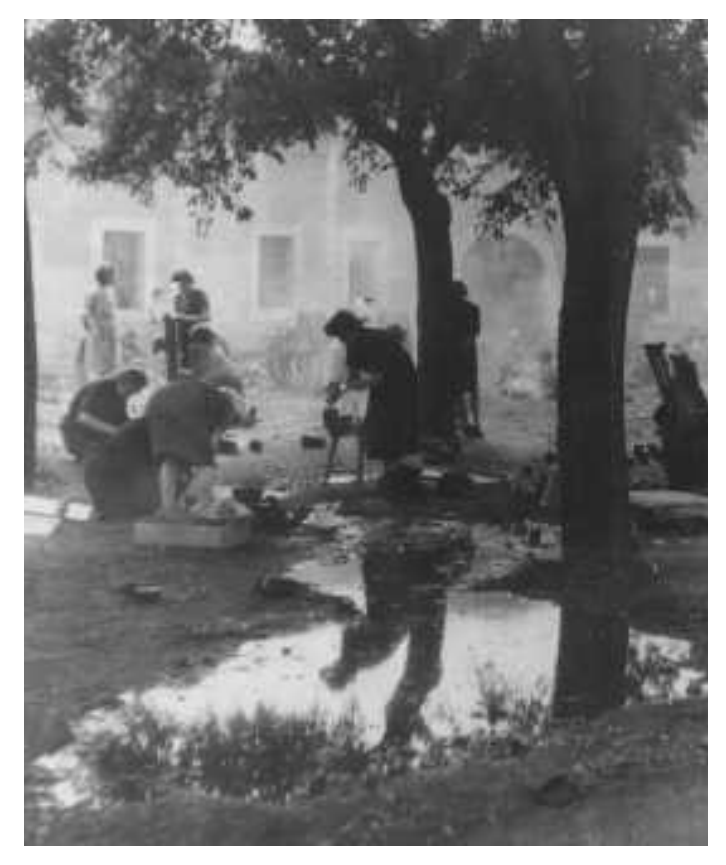
Terezín women preparing food outdoors

Of course, deportation to Terezín did not provide the safety promised by the Germans to many of the Jews. This was due