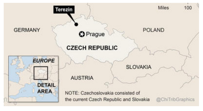
on November 24, 1941, the first Jewish prisoners arrived in Terezín.

Following the Munich Agreement of 1938, the Germans annexed the Sudetenland along the border of Czechoslovakia, and in March of 1939, the rest of the Czech provinces were occupied and organized into the Protectorate of Bohemia and Moravia. This included the city of Terezín, which then served as a Nazi military base until 1941. Reich Security Main Office Chief Reinhard Heydrich then tasked SS First Lieutenant Siegfried Seidl with reorganizing the city to function as the primary way-station for Jews of the Protectorate to be transported to the east. Seidl ordered the import of 1,000 Jews for labor to accomplish this task, and