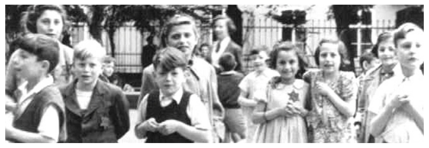
A photograph of children in Terezín taken by the Red Cross on their visit in 1944

group of Jews was also deported to Terezín: prominent Jews, including artists or musicians. Deporting them to the east likely would have resulted in their deaths, possibly raising questions or concerns from citizens, domestic or abroad, who were familiar with them.