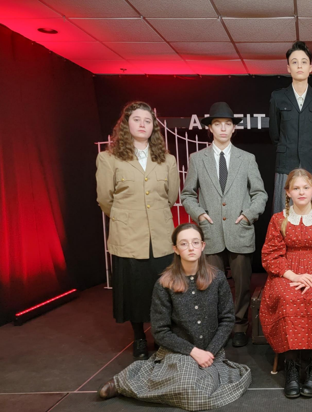
The Cast of