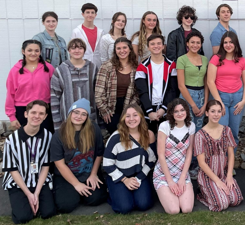
The Cast of